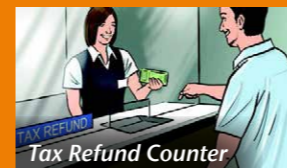
Tax Refund Counter