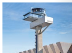
③ New tower of the German Air Traffic Control (DFS)