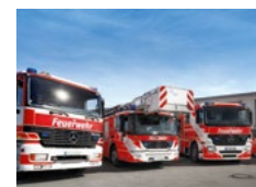
⑥ Fire station 3