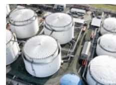
⑤ Fuel depot