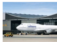
④ Lufthansa's jumbo hangar