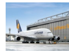
⑦ Airbus A380 maintenance hangar