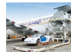
⑧ CargoCity South