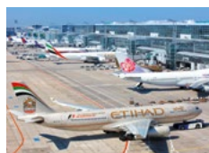
① Terminal 2