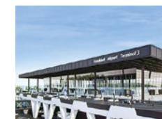
⑨ Future Terminal 3