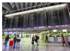
② Terminal 1